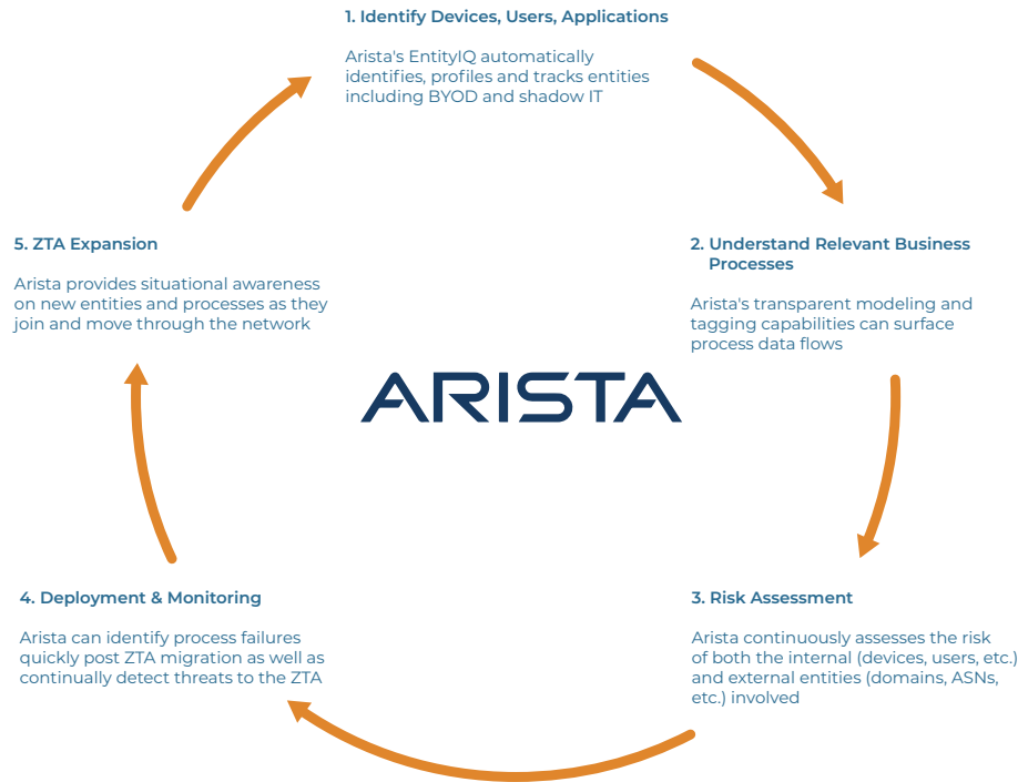
Figure 5: Arista Enables Your Zero Trust Architecture Journey

Building a zero trust architecture is a noble goal, especially in times like these where IT teams are being asked to make the organization productive irrespective of the location of users and needed resources. However, as NIST 800-207 points out, this is not a shiny red button that can magically transform the organization. Embarking on this journey needs careful thought to ensure organizational productivity and enhanced security.