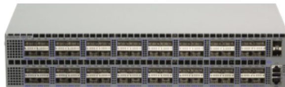
Figure 6: Arista 7260CX-64 series

The 7260CX-64 is a 2 RU system that provides 64 QSFP100 ports and 2 SFP+ ports. Each QSFP100 port can be individually broken out into 4 ports of 10GbE or 25GbE; 2 ports of 50GbE or used as a single port of 40GbE or 100GbE.