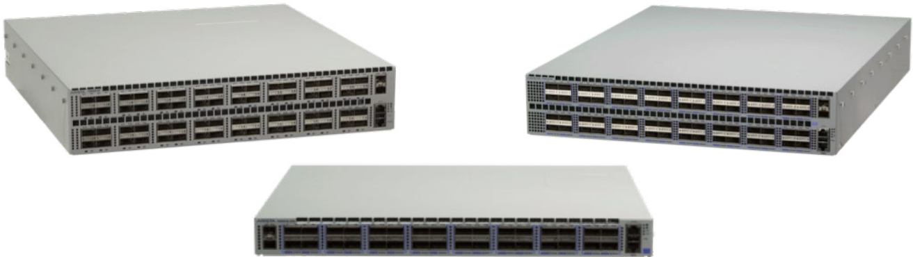
Figure 1: Arista 7060X & 7260X series overview

At their core the 7060X, 7060X2 and 7260X series are specifically developed to address the requirements for increasing server and storage interface speeds. Faster host connectivity gives rise to a network requirement for the forwarding of a significantly greater number of packets per second. In order to meet this requirement the 7060X, 7060X2 and 7260X feature an optimized forwarding pipeline supporting wire-rate forwarding even under extreme loads.