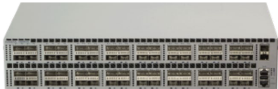
Figure 5: Arista 7260QX-64 series

The 7260QX-64 is a 2 RU system that offers 64 QSFP+ ports and 2 SFP+ ports. The QSFP+ interfaces each support wirespeed 40GbE, enabling high density with a single chip design that ensures latency remains below 550ns regardless of ingress and egress port mappings, while maintaining consistently low jitter.