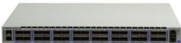
Figure 7: Arista 7060CX2-32S series

The 7060CX2-32S is a 1RU system that re-implements the 7060CX-32 but provides packet memory buffer that is increased by 40% to 22MB to address lossless network environments. Featuring 32 QSFP100 and two SFP+ ports, all of which can be enabled concurrently. Each QSFP100 interface can be individually broken out into 4 ports of 10GbE or 25GbE; 2 ports of 50GbE or used as a single port of 40GbE or 100GbE. The 7060CX2-32S also features