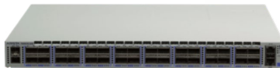
Figure 4: Arista 7060CX-32S series

The 7060CX-32S is a 1 RU system with 32 QSFP100 ports and 2 SFP+ ports. Each QSFP100 port can be individually broken out into 4 ports of 10GbE or 25GbE; 2 ports of 50GbE or used as a single port of 40GbE or 100GbE.