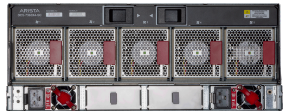
Arista 7368X4 Series Rear