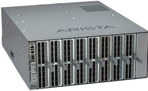
Arista 7368X4 Series