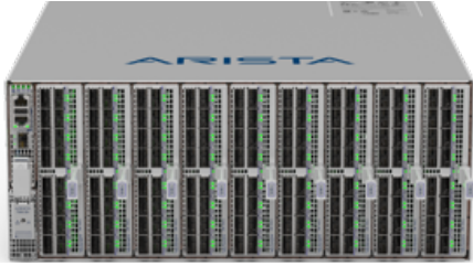
Arista 7280R3A Modular System