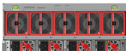
Arista 7280R3A Modular (Rear)