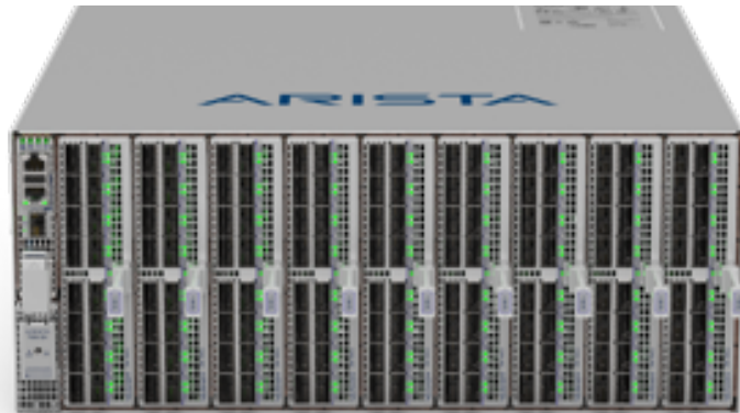
Arista 7280R3A: 144 ports of 100G or 36 ports of 400G

All elements of the 7280R3A modular are field replaceable, and optimized for simple maintenance, a broad range of network interfaces with a choice of industry standard interfaces allowing for easy transitions to the latest 100G/400G networks. Combined with Arista EOS the 7280R3A series deliver advanced features for high performance large scale layer 2 and layer 3 cloud designs, enterprise data centers and service provider networks.