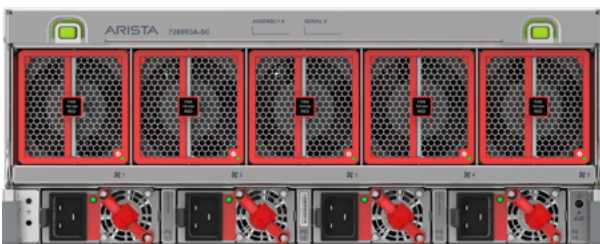
System Rear (Front to Rear Airflow)