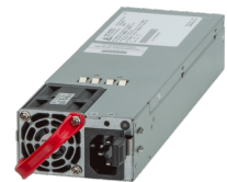
1.5kW Hot swap power supplies