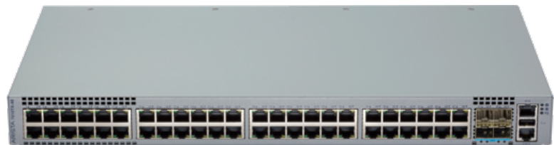
Arista 7010TX-48, 7010TX-48C and 7010TX-48-DC: 48 port 10/100/1000 and 4 port 10/25GbE Switch

Combined with Arista EOS, the 7010X Series delivers the flexibility and features for scale out applications in cloud, virtualized and traditional network designs and accommodates the myriad different applications and east-west traffic patterns found in modern data centers.