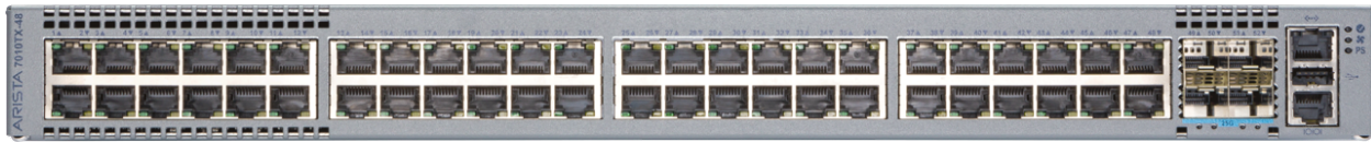
Arista 7010TX-48 and 7010TX-48C: 48 port 10/100/1000 and 4 port 10/25GbE Switch

Each of the four SFP ports supports a choice of speeds with flexible configuration between 1GbE, 10GbE, or 25GbE. All ports can operate in any supported mode without limitation, allowing easy migration from lower speeds and the flexibility for deployment over existing fiber infrastructure.